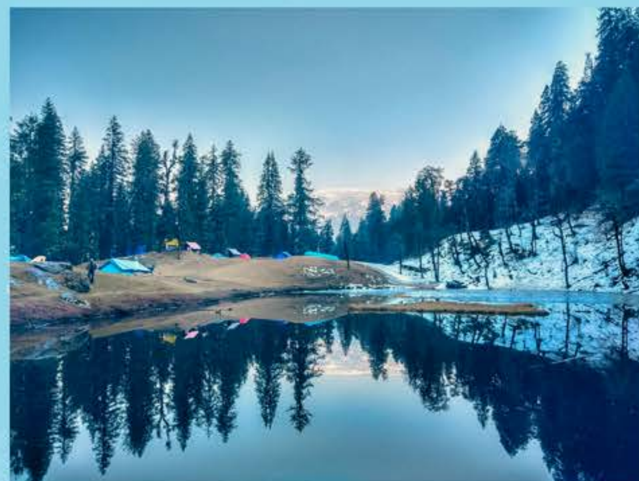
JUDA KA TAAL