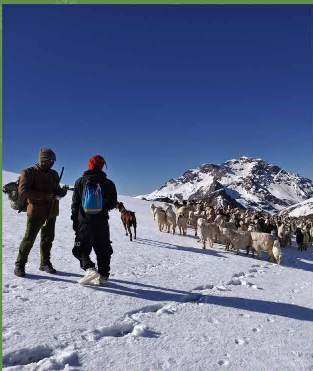
HIGH-ALTITUDE SNOWFIELDS & PASS CROSSING