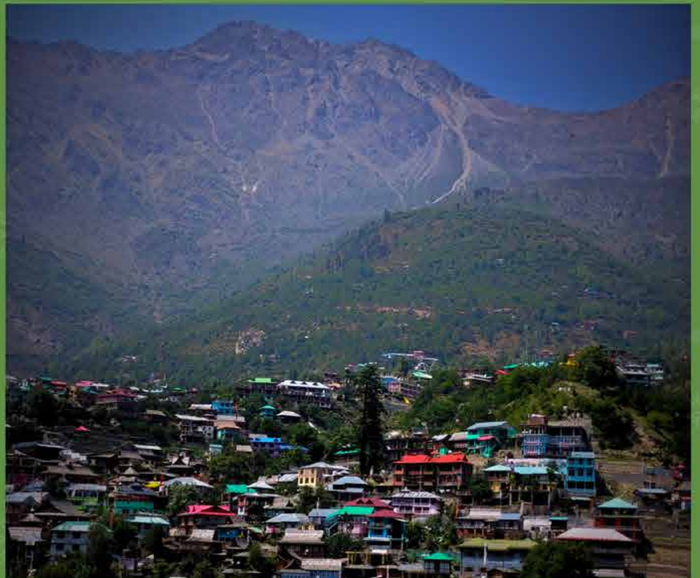
HANGING VILLAGES & REMOTE CULTURE