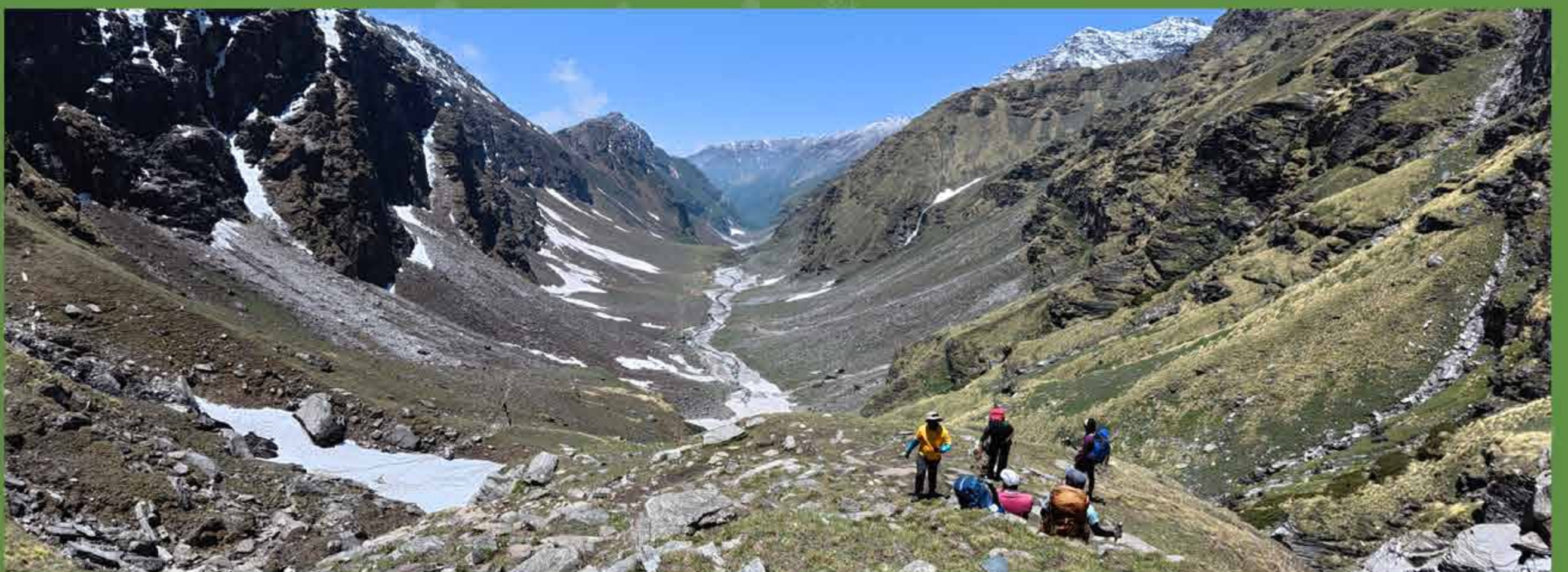
EVER-CHANGING HIMALAYAN LANDSCAPES