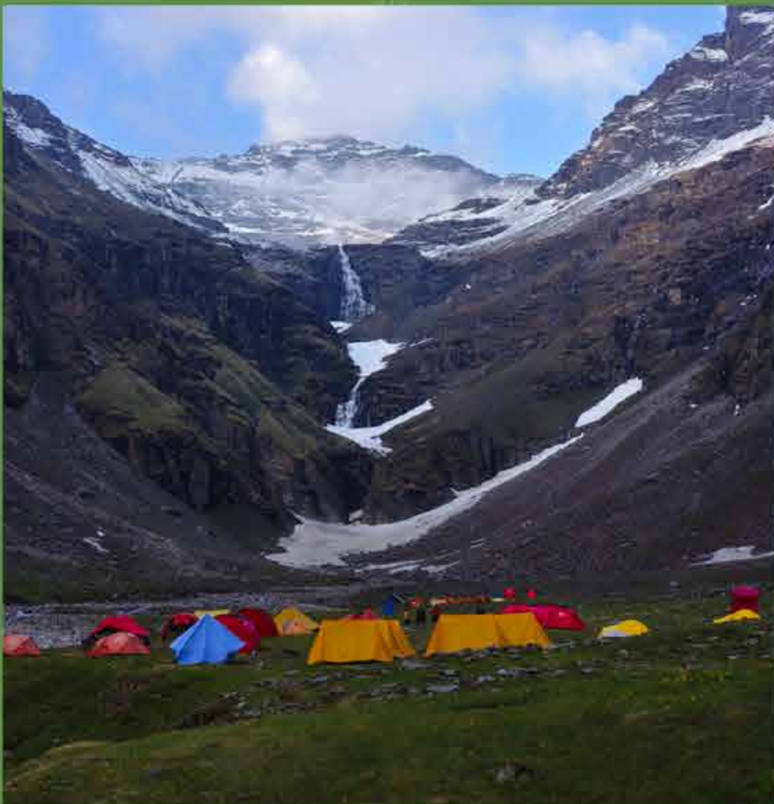
DRAMATIC RUPIN WATERFALL ASCENT