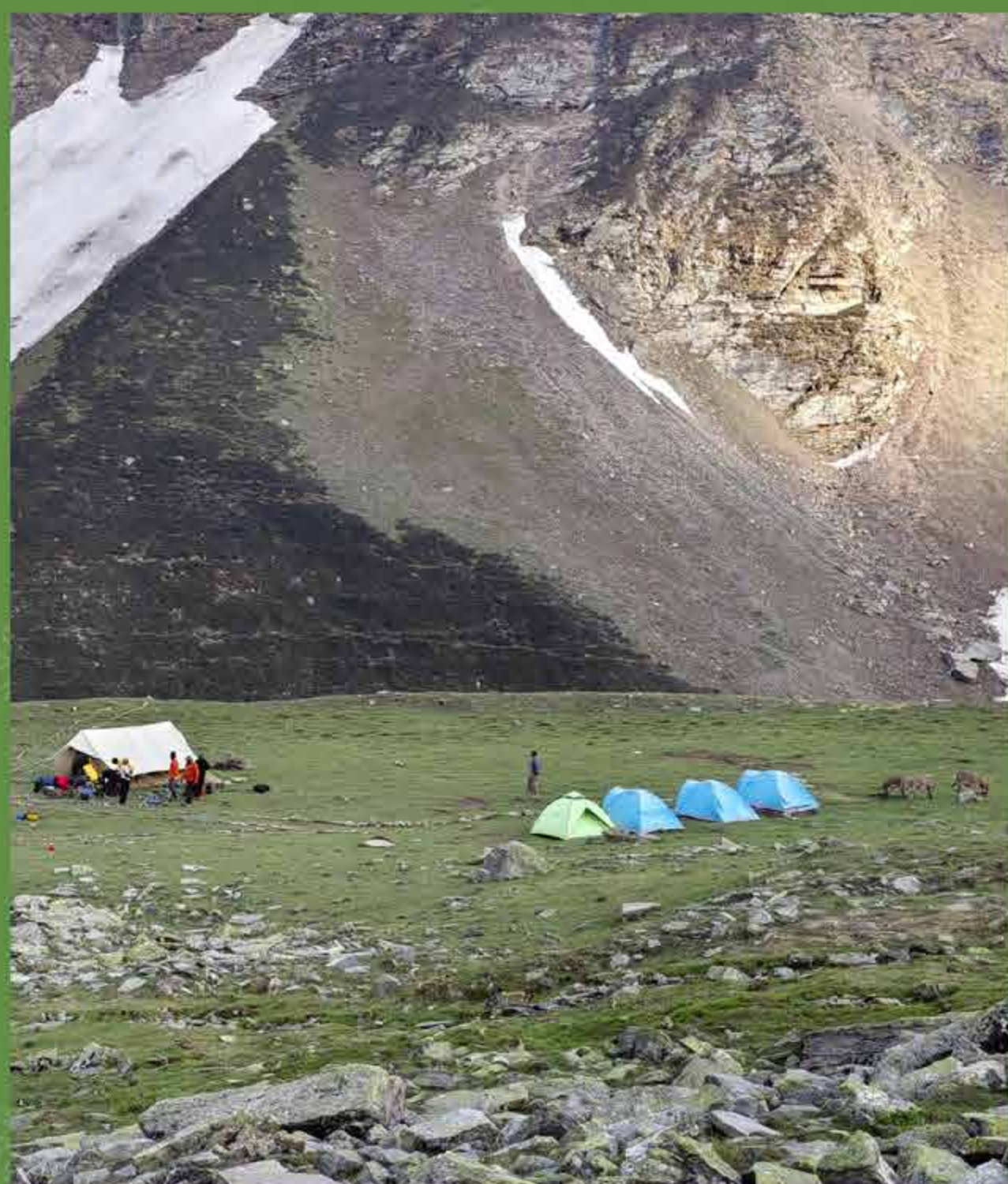
WILDFLOWER MEADOWS & ALPINE CAMPS